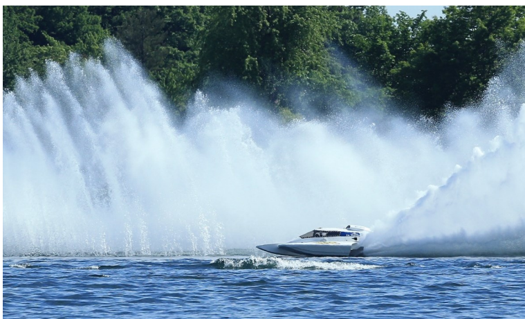
Gananoque Nickel Cup Races