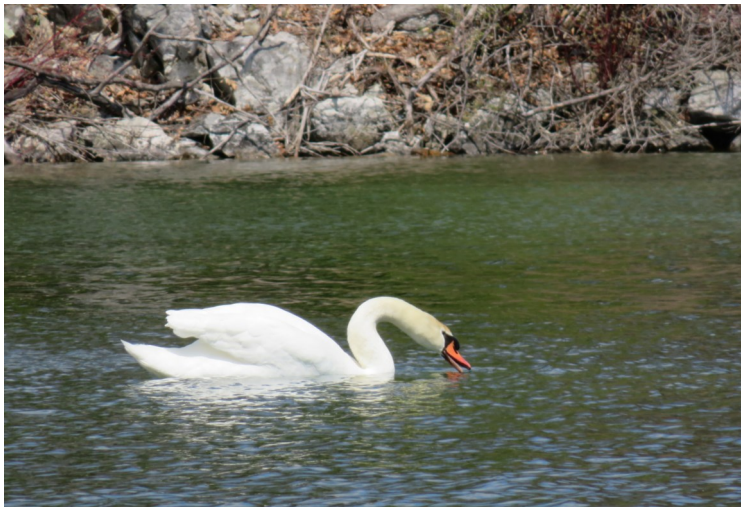
Swan pictures near Half Moon Bay.