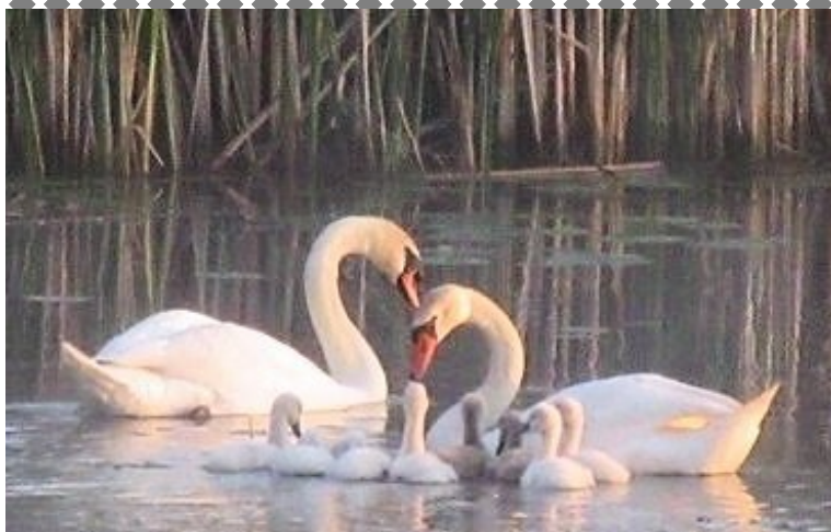
Picture by Alan Bickerton from the 1000 Islands bike path. There are 8 signets in this picture, only 4 at last sighting.

We have 8 months for a solution. David Orr