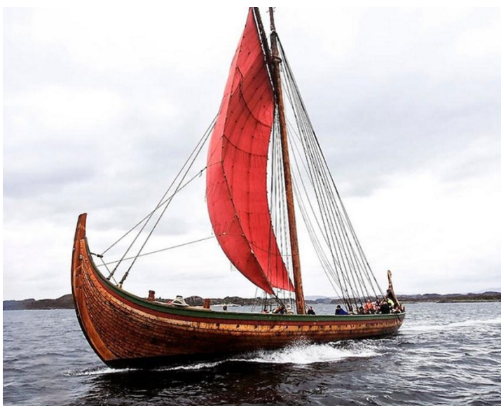
The Dragon Harald Fairhair is at this writing in the city of Brockville, ON. The Dragon crossed the Atlantic last month. On board the boat there is a tent, their only shelter for 16 sailors at a time. The crew sleeps in watches, 4 hours work, 4 hours rest. There is no "under deck", it is so shallow there is only room for ballast and food storage below.

All sailboats under 22 feet are encouraged and welcome. Dust them off and sail out for this event, you won't be disappointed.