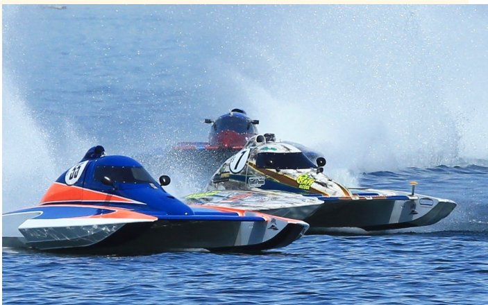
Gananoque Nickel Cup Races.